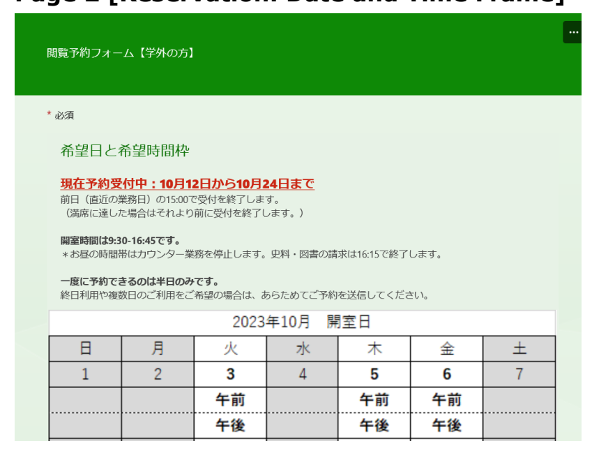
Page 2 [Reservation: Date and Time Frame]